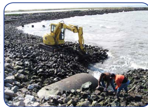
The City has conducted a series of engineering studies to determine the best ways to protect neighborhoods during big storms and sea level rise.

Each parcel with a proposed fee greater than zero will count for a vote. Ballots will be tabulated under the direction of the City Clerk at a location accessible to the public. The tabulation will commence at 9:00 am on Tuesday, November 26, 2019, in City Hall at 2263 Santa Clara Avenue Room 380 and continue between the hours of 9:00 am and 4:00 p.m. until the tabulation is complete.