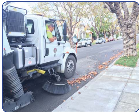
The City's Clean Water Program removes 823 dump truck loads of debris, including debris from the City's streets by sweeping 24,000 miles annually.

If you lose your ballot, require a replacement ballot, or want to change your vote, contact Sarah Henry at (510) 747-4714 or by email at shenry@alamedaca.gov for another ballot. See the enclosed ballot for additional instructions.