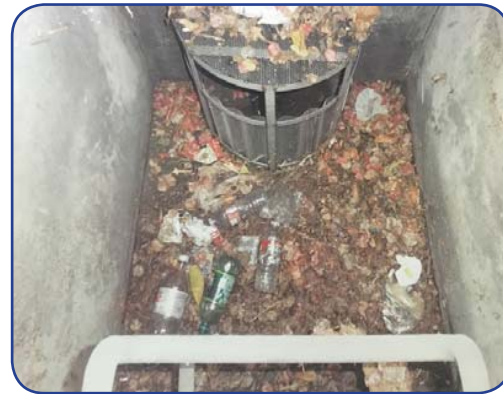
The City cleans and inspects 250 trash capture devices quarterly, removing 40 cubic yards of debris annually.

The proposed 2019 Water Quality and Flood Protection Fee revenues will be collected and deposited into a separate account that can only be used for authorized storm drainage activities and will undergo annual independent audits. The City Council must approve the fee each year in a public meeting, and the fee can never exceed actual estimated costs.