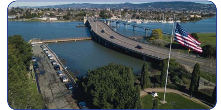
The City of Alameda's Clean Water Program maintains the storm drainage infrastructure which protects homes, property, and streets from flooding and protects the City's beaches and the Bay from trash and pollutants caused by urban runoff during rain events.

To continue to maintain our storm drainage infrastructure and avoid eliminations and/or significant cuts to existing programs, the Clean Water Program is proposing The 2019 Water Quality and Protection Initiative . This additional storm drainage fee is dedicated to our storm drainage system and funds cannot be used for any other purposes.