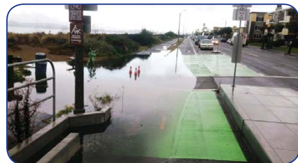
With such flat terrain and topography in our neighborhoods, the City of Alameda experiences frequent flooding of streets that also flow onto nearby properties. As shown in the City's recently adopted Climate Action and Resiliency Plan, this flooding will only grow in frequency and severity with climate change and sea level rise.

No. The Clean Water Program started in 1992 with a fee charged to properties. This has been the only revenue source for the Program since its inception. This is similar to water and sewer rates where the activities to provide those services are supported solely by user rates. This ensures that the rates are fair and equitable, and funds cannot be used for other purposes.