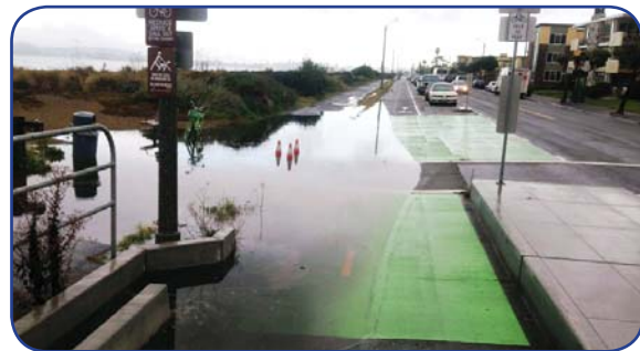
With such flat terrain and topography in our neighborhoods, the City of Alameda experiences frequent flooding of streets that also flow onto nearby properties. As shown in the City's recently adopted Climate Action and Resiliency Plan, this flooding will only grow in frequency and severity with climate change and sea level rise.

No. The Clean Water Program started in 1992 with a fee charged to properties. This has been the only revenue source for the Program since its inception. This is similar to water and sewer rates where the activities to provide those services are supported solely by user rates. This ensures that the rates are fair and equitable, and funds cannot be used for other purposes.